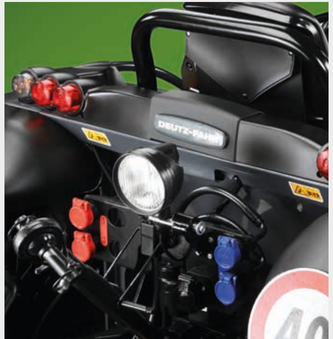
Up to 6 rear hydraulic couplers.