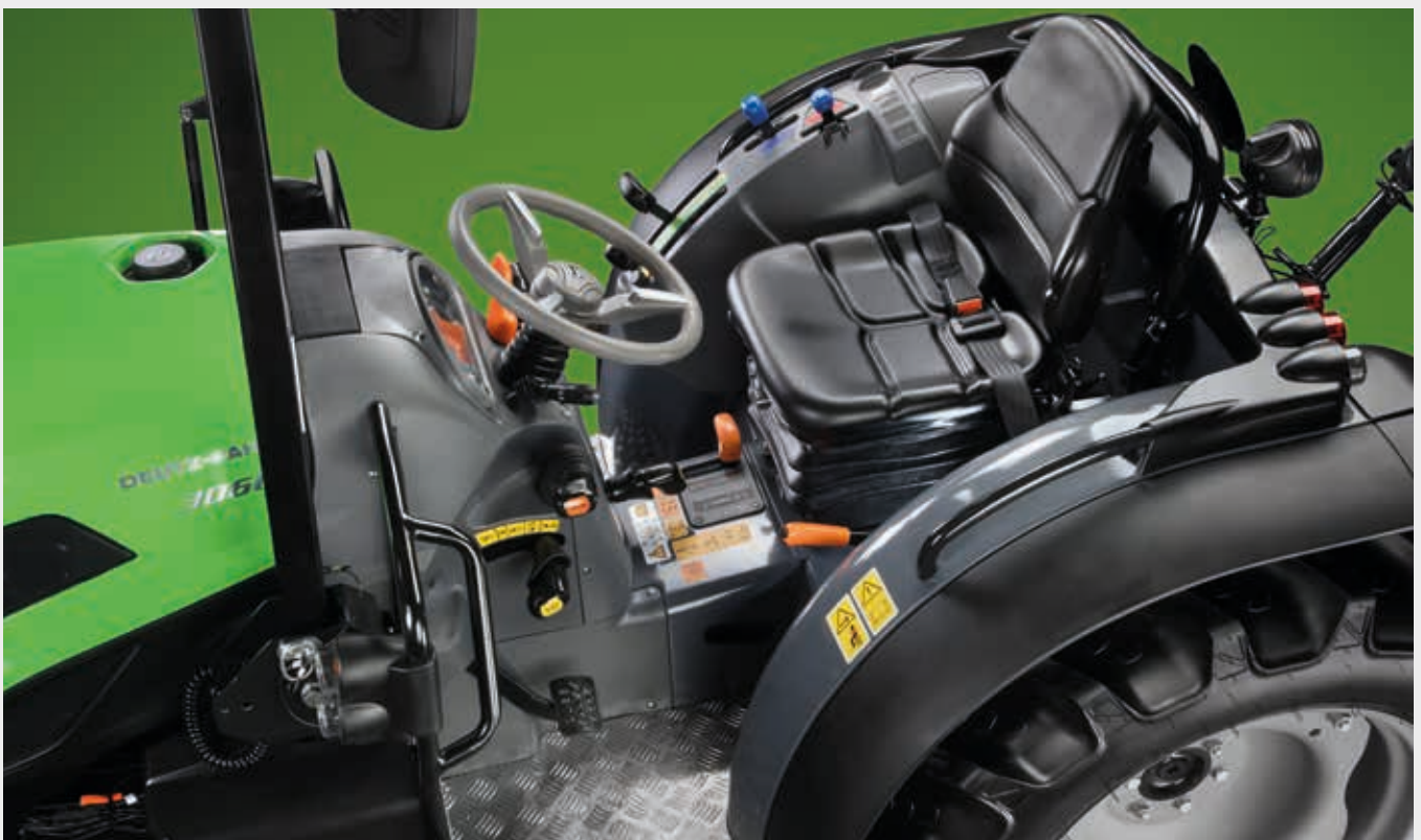
↑ ROPS version with platform suspended on Silent-Block mounts.

And for even greater comfort when working in hot climates, a high power air conditioning system is also available. Other options include active carbon air filters which, when used in conjunction with the positive pressure cab ventilation system, offer effective protection to the driver .