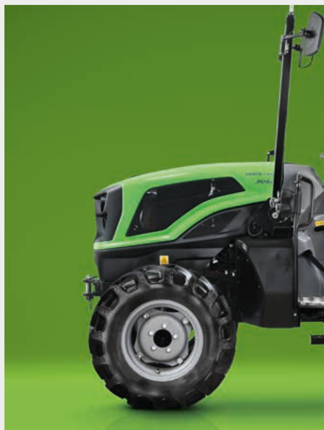
Best visibility thanks to the low bonnet profile.

The compact 2200 cm 3 four-cylinder engine with electronically controlled common rail injection and turbocharger with wastegate equipping the 3 Series has a maximum rated speed of 2600 rpm and develops maximum torque at just 1600 rpm (as on the brand's higher power models), benefiting both reliability and fuel efficiency. Combined with the generous 40 litre fuel tank, this allows these tractors to keep on working uninterruptedly for hours. The outstanding performance of these new engines sets new standards for this power class, while maintenance and emissions are also minimised.