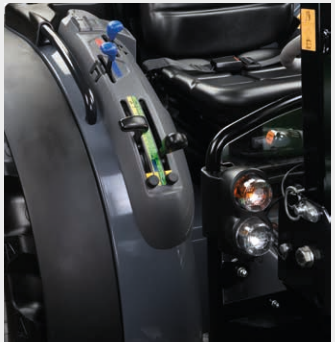
Rear lift with draft, position and mixed control.

The hydraulic system comes as standard with dual pumps and potent lifts, meaning that Series 3 tractors can tackle any task with confidence and work with implements normally used only with machines belonging to higher power classes. In the base configuration the hydraulic system features a 30 l/min pump feeding the lifts and distributors (available with up to 6 couplers), and a secondary 15 l/min pump dedicated solely to the hydraulic steering system, which ensures effortless steering and impeccable manoeuvrability even at low engine speeds and when handling heavy loads with the lift. The rear lift boasts an impressive maximum load capacity of 1.320 kg (at the link ends), and features position, draft, mixed position-draft control and float modes.