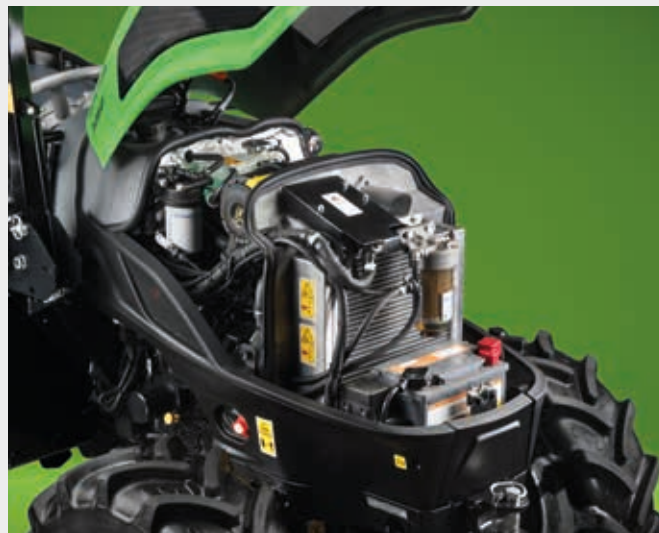
Stage V compliant engines with Common Rail injection and power outputs up to 59 HP.