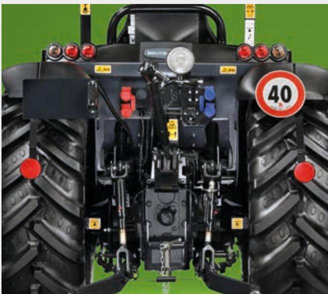
↑ 3-speed PTO and groundspeed PTO to cater for any application.