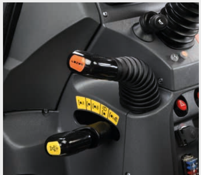
↑ Mechanical transmission with synchronized reverse shuttle.